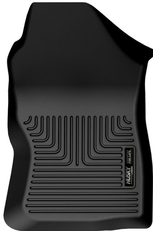
RIGHT OR PASSENGER'S SIDE

TO EASE INSTALLATION OF YOUR FRONT LINERS, MOVE BOTH FRONT SEATS TO THEIR MOST REARWARD POSITION. NEXT, REMOVE ANY EXISTING FLOOR MATS AND INSTALL THE LINERS, POSITIONED AS SHOWN ABOVE. TAKE CARE THE LINERS ARE SECURED TO THE FACTORY FLOOR MAT RETENTION HOOKS LOCATED IN THE VEHICLE FLOOR. ONCE THE LINERS ARE INSTALLED, MOVE THE FRONT SEATS TO THEIR DESIRED LOCATIONS.