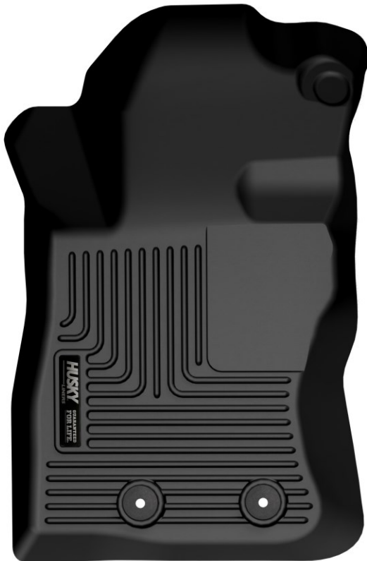
LEFT OR DRIVER'S SIDE