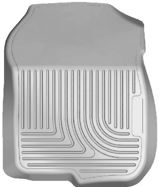
RIGHT OR PASSENGER'S SIDE

TO EASE INSTALLATION OF YOUR FRONT LINERS, MOVE BOTH FRONT SEATS TO THEIR MOST REARWARD POSITION. ONCE YOU HAVE INSTALLED YOUR LINERS, REPOSITION THE SEATS AS DESIRED. TAKE CARE THAT BOTH FRONT LINERS ARE ATTACHED TO (SNAPPED OVER) THE FACTORY FLOOR MAT POSTS.