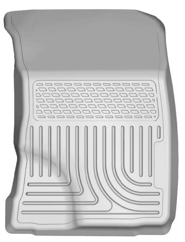
RIGHT OR PASSENEGER'S SIDE

TO EASE INSTALLATION OF YOUR CIVIC FRONT FLOOR LINERS, FIRST SLIDE BOTH FRONT ROW SEATS ALL THE WAY BACK TO EXPOSE THE FRONT FLOOR PANS. ONCE YOU HAVE INSTALLED THE FRONT LINERS, REPOSITION THE FRONT SEATS AS DESIRED. NOTE THAT DRIVER'S SIDE LINER ATTACHES TO THE FACTORY "TWIST-LOCK" FASTENERS LOCATED IN THE DRIVER'S SIDE FLOOR PAN.