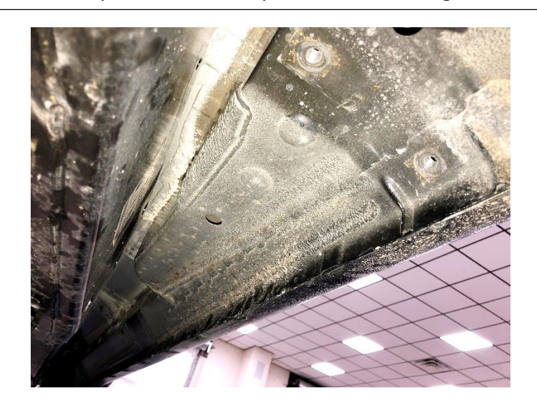
STEP 4: Carefully place step into place and loosely fasten using the supplied M10X25mm hardware.

STEP 2: Remove any factory running boards or hardware and discard. STEP 3: Clean/tap the three factory threaded mounting locations.