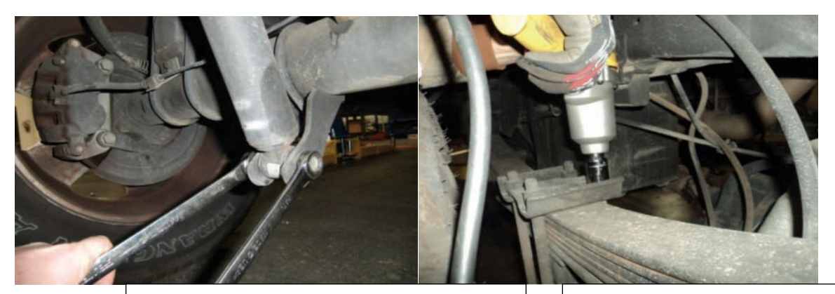
Remove the lower shock mount hardware.

Remove U-bolt nuts on top of spring pack.