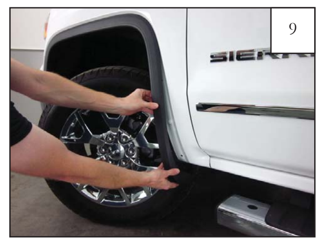
Starting at the lower rear end of the factory flare, firmly grip part and pull to remove from vehicle. Note: You will hear popping sounds as the factory fasteners release from vehicle. This is normal.