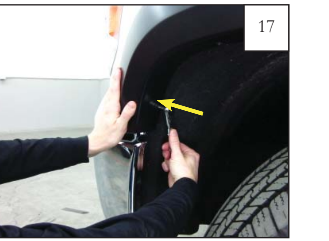
While holding Flare on vehicle, install factory screw removed in Step 7 through flare and into factory hole. Do not fully tighten at this time.