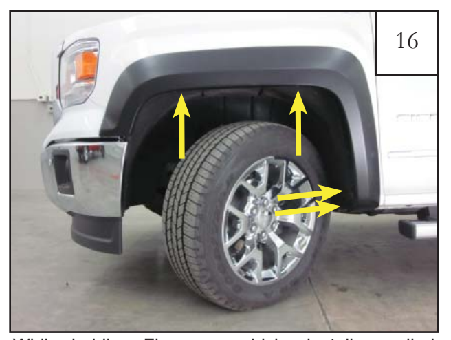
While holding Flare on vehicle, install supplied screws (SW1-0056) into the two upper and lower factory holes locations. Do not fully tighten at this time.