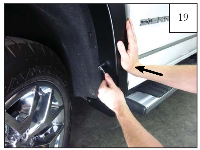
FOR MODELS WITH FACTORY MUDFLAP: Reinstall factory fastener removed from mudflap in step 5. Press flare towards vehicle while fully tightening using a T-30 Torx Bit.