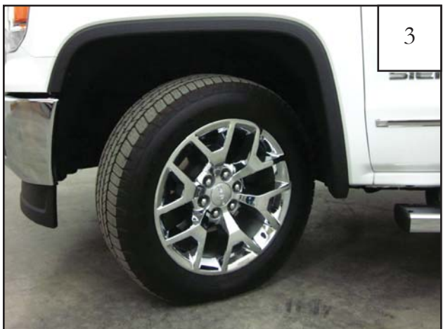
Turn front tire outward for easier installation. Factory wheel arch molding must be removed prior to part installation. See next steps.