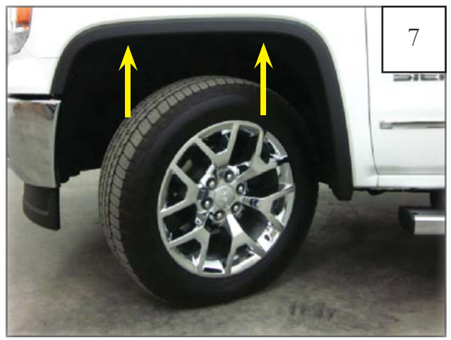
Remove two fasterners along top of factory wheel arch molding using a T-15 Torx bit.