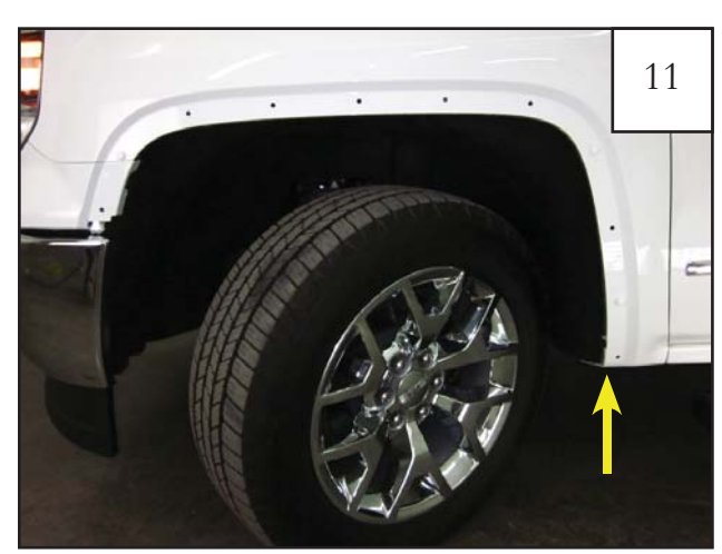
Reinstall factory fastener removed in step 9 using a 1/2" socket and wrench.