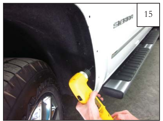
Remove the flare. Using a 3/32" drill bit, drill a pilot hole through the factory wheel well liner and sheet metal at location marked in previous step.