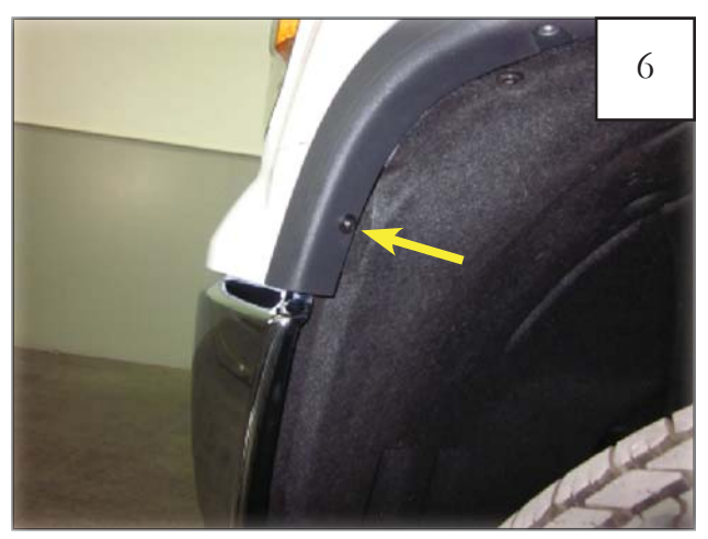
Remove fastener from front of factory wheel arch molding using a 9/32" or 7mm socket and wrench. Save for reinstallation.