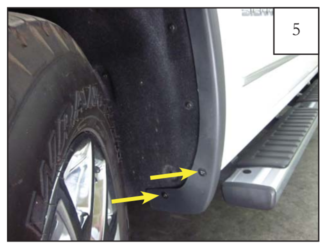
Remove two lower fasterners from factory wheel arch molding using a T-15 Torx Bit.