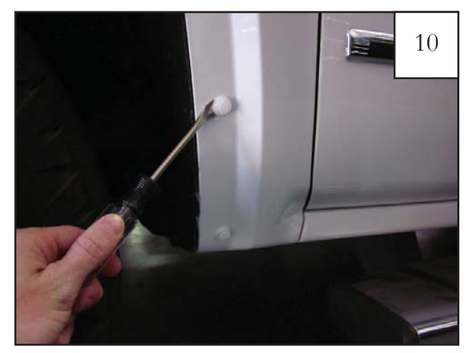
Use a pry tool to remove any remaining factory fasteners that may have stayed on the vehicle during the removal process.