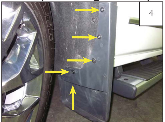
FOR MODELS WITH FACTORY MUDFLAP: Remove mud flap fasteners. Use T-30 Torx bit for two upper fasteners. Use T-15 Torx Bit for two lower fasteners and use a Phillips Head Screwdriver for Bottom fastener.