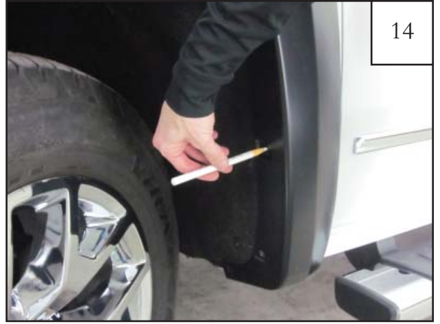
Using a grease pencil or marker, mark one hole location for drilling using the upper rear hole location in the flare as a guide. Note: This step not needed for models with factory installed mudflaps.