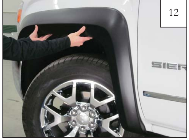
Hold Front Flare up to wheel well to confirm fit. Do not install fasteners at this time.