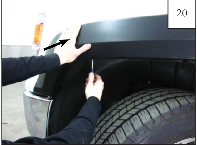
Press flare towards vehicle and fully tighten all remaining fasteners.