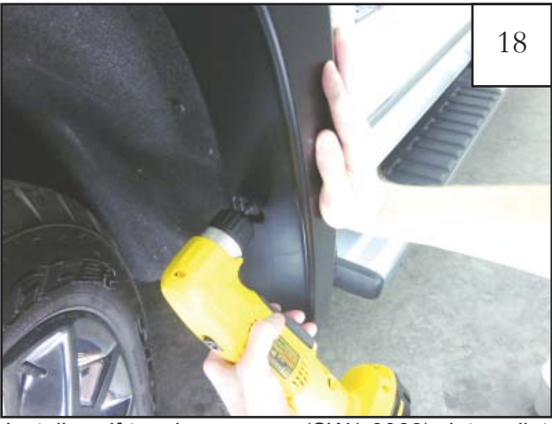
Install self-tapping screw (SW1-0066) into pilot hole drilled in step 16. Press flare towards vehicle while fully tightening. Note: This step not needed for models with factory installed mudflaps.