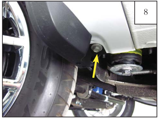
Remove fastener from rear underside of factory wheel arch molding using a 1/2" socket and wrench. Save for reinstallation.