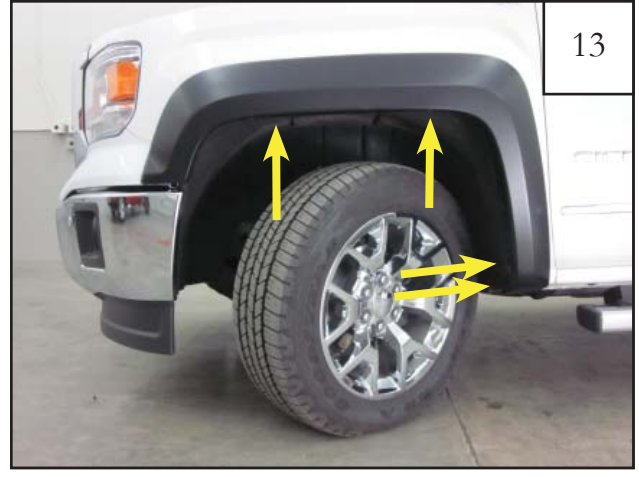
While holding Flare on vehicle, install supplied screw (SW1-0056) into the four factory hole locations as shown. Do not fully tighten at this time.